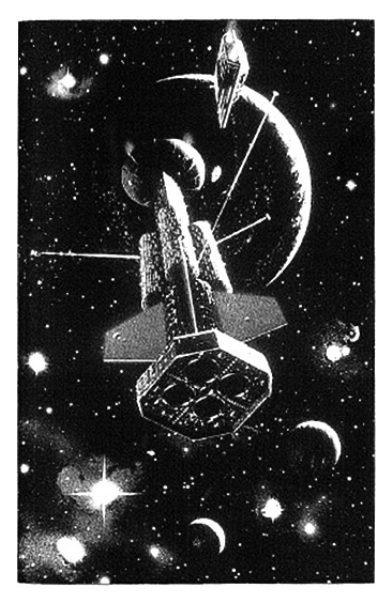
Figure 4: Opening picture from Öffentlichkeit und Erfahrung

that Kluge's science fiction differs from its affirmative counterparts that rely on a confirmation of the status quo (morally, technologically, and economically), it is by virtue of the inherent conformism associated with the genre that Kluge's science fiction is able to perform a critique. In this way Die Ungläubige, as a work of science fiction, both differs from and engages in dialogue with Die Artisten. »Die Schwierigkeiten der Kunstproduktion im Kapitalismus«, Lewandowski remarks about Die Artisten, »liegen aber nicht nur in der finanziellen Abhängigkeit des Künstlers, das wäre zu einfach gesehen, sondern auch in Momenten der Kunst selbst«.<sup>38</sup> That is, the latent contradictions and difficulties of artistic production under capitalism do not merely manifest themselves as financial impediments but materialize in the artwork itself. This is the case with Die Ungläubige as well. As a work of science fiction, it is haunted both by the failed possibilities of its early origins and by the later