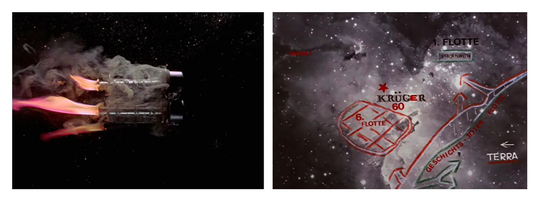
Figure 2: Stills from Willi Tobler und der Untergang der 6. Flotte

It is Méliès' early films, particularly Le voyage dans la lune (1902), rather than the grandiose production of the seminal science fiction film of the late 1960s – Stanley Kubrick's 2001: A Space Odyssey (1968) – to which Kluge's science fiction is indebted (see figure 3).<sup>26</sup>