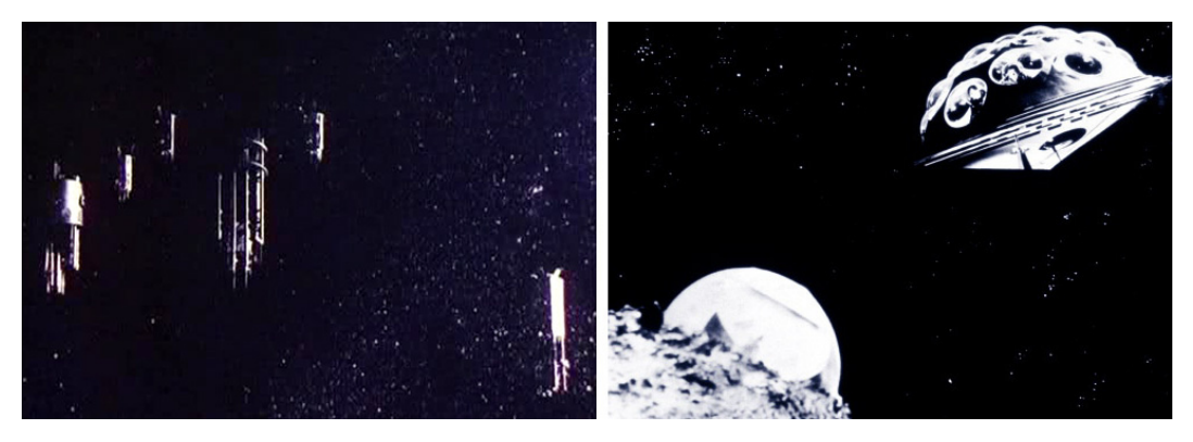
Figure 1: Depictions of spaceships from Der Große Verhau

To be sure, Die Ungläubige does not function on the overt and complex allegorical level of Die Artisten in dealing with the obstacles to the production of a revolutionary, utopian cinema. At the same time, however, and in a different manner than Die Artisten , Kluge's science fiction mines a specific aesthetic. A look forward to Kluge's later full-length sci-fi films Der Große Verhau (1969) and Willi Tobler und der Untergang der 6. Flotte (1971) can provide some insight into this sci-fi aesthetic. These films, which are characterized by what Miriam Hansen calls »deliberately dilettante trick photography«, reflect the influence of Georges Méliès on Kluge's work is characterized by the frequent use of intertitles, montages of crude drawings and photographs, and spaceships and space stations constructed out of spare parts from television sets (see figures 1 and 2).